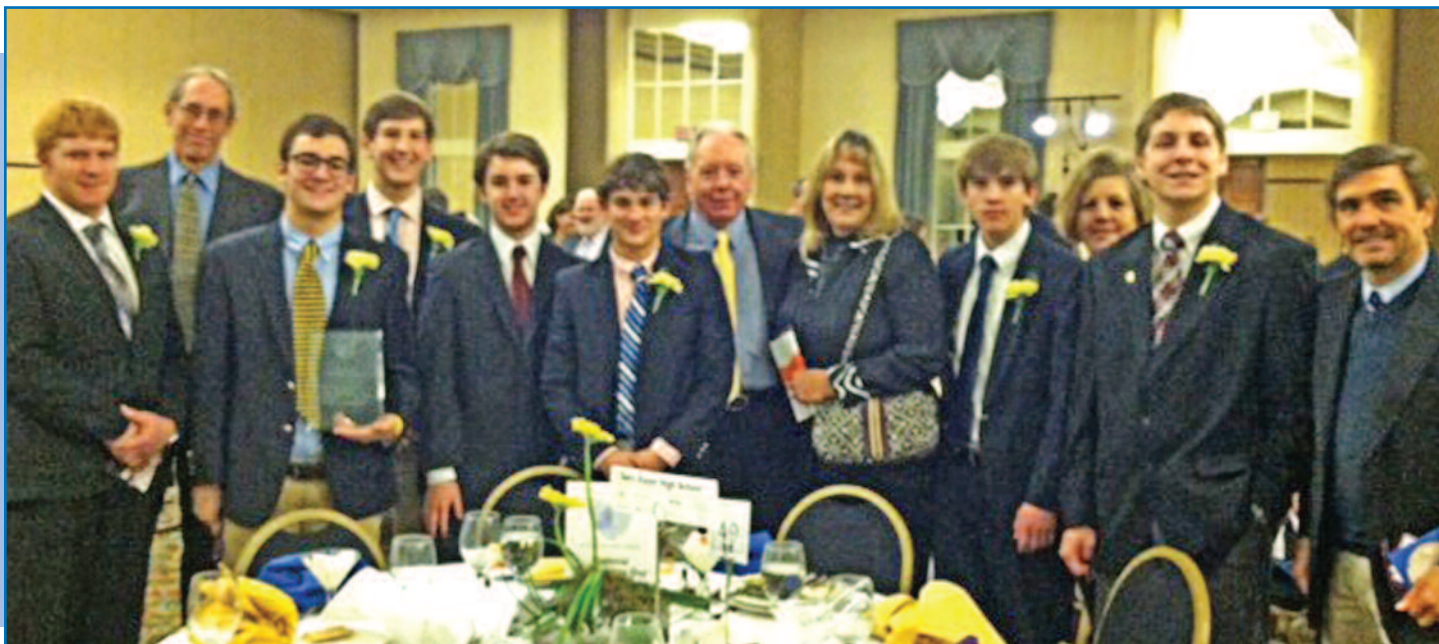
The Greater Louisville Chapter of the Association of Fundraising Professionals, working to advance philanthropy through education, training, and mentoring, presented its 2012 "Outstanding Youth in Philanthropy Award" to the St. Xavier Joseph of Arimathea Society. This award recognizes an individual or a group of young people who demonstrate outstanding commitment to the Greater Louisville/Southern Indiana community. Pictured here are the students and faculty members who attended the presentation ceremony.

Contractors, JRA Architects, and Metro Parks have become partners, providing funds, goods and services.