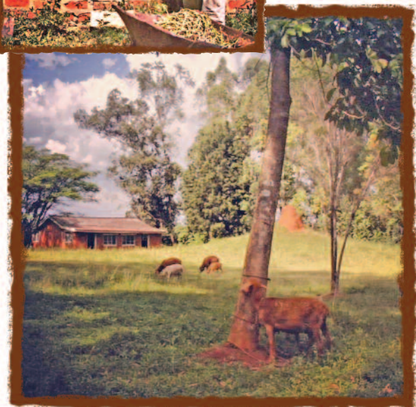
This field where goats currently graze, is likely to serve as the central campus of a Xaverian Brothers boarding school on the St. Joseph’s Centre property in Bungoma.