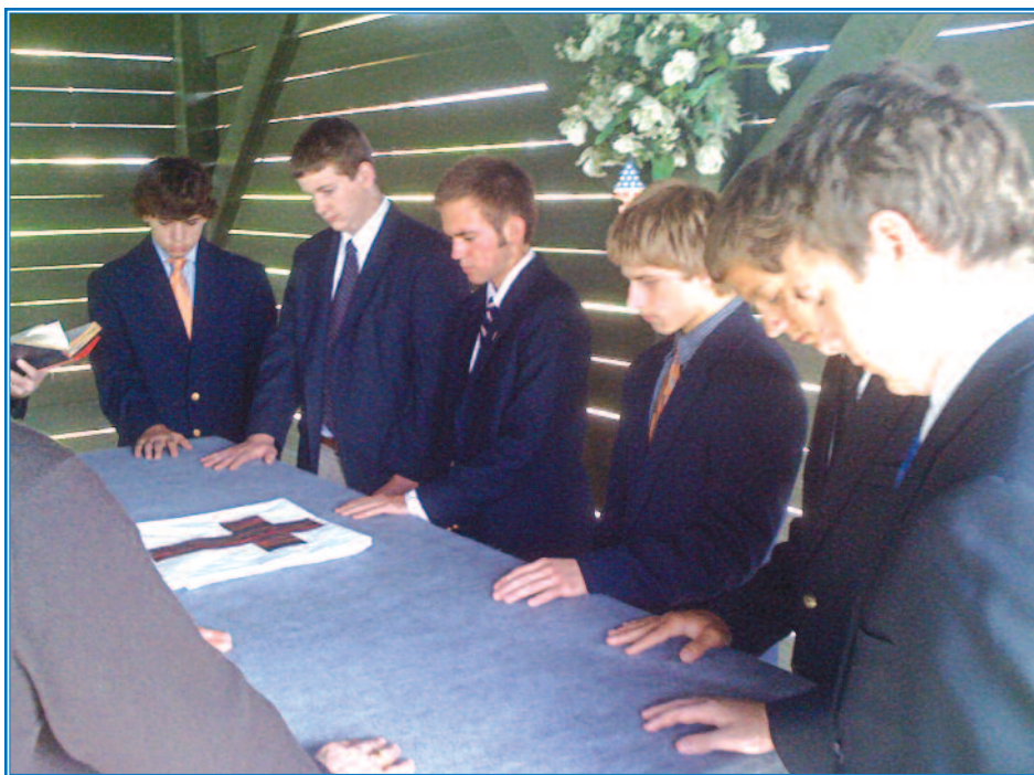
Students show deep reverence as they accompany the poor to their final resting place.

Since its beginning in 2006, members of the St. Joseph of Arimathea Society have performed burial services