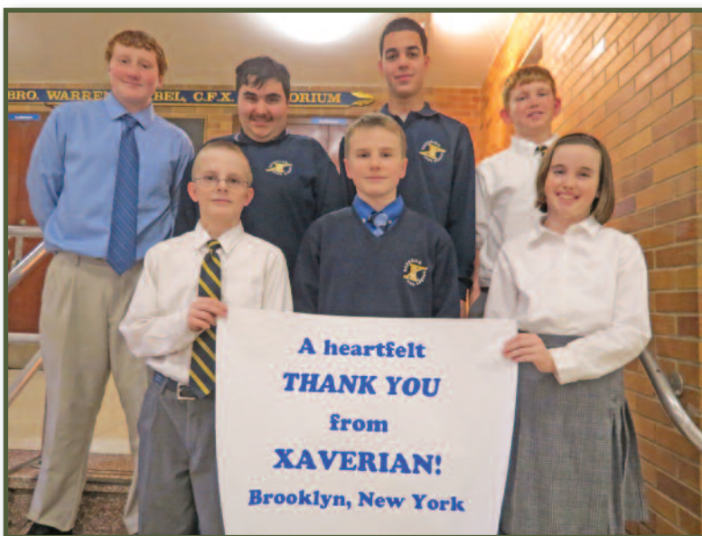
Students from Xaverian's middle and high school grades extend a heartfelt thank you to all who offered prayers, well wishes, and donations as they and their families recovered after Hurricane Sandy.