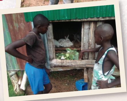
Hundreds of African boys like these look to Xaverian Brothers and our missions for an escape from hunger and homelessness.