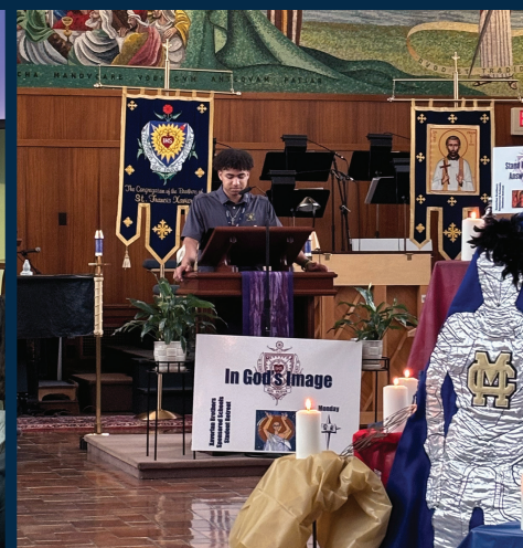
One of the student leaders addressing the retreatants.