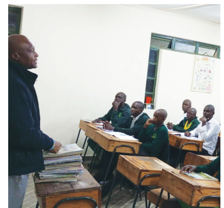
One of the classes at St. Xavier High School in Bungoma, Kenya learning about the lived reality of our shared Xaverian Charism.