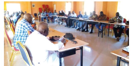
Brothers in the Congo region during the Day of Recollection.

On February 11th, all the Brothers in the Congolese region participated in a day of recollection on the lived reality of the Xaverian Charism. The recollection was held at the Carmelite Fathers' retreat house.