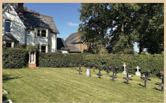
Right: Mayfield Cemetery after being cleaned up by the COXA members.

Their dedication extends beyond their own alumni. COXA has generously “adopted” the historical Mayfield College and Cemetery, which was run by the Xaverian Brothers from 1868 to 1995. The cemetery, the final resting place for 82 Xaverians, had fallen into disrepair. Thanks to the tireless efforts of the COXA, this sacred site is now being lovingly restored and maintained, proving that the Xaverian call to service endures.