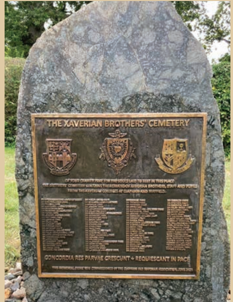
Above: The COXA members added this stone inside the cemetery entrance. They went to Wales to select the stone and transported it to the cemetery as well as having the plaque made and installed. It ties together the Brothers, Clapham and Mayfield Colleges.

Ninety years after the Xaverian Brothers first established Clapham College in Southwest London in 1897, the school closed its doors. However, the spirit of the Xaverian family lives on through the Clapham Old Xaverians Association (COXA), which celebrates its 100th Anniversary this year!